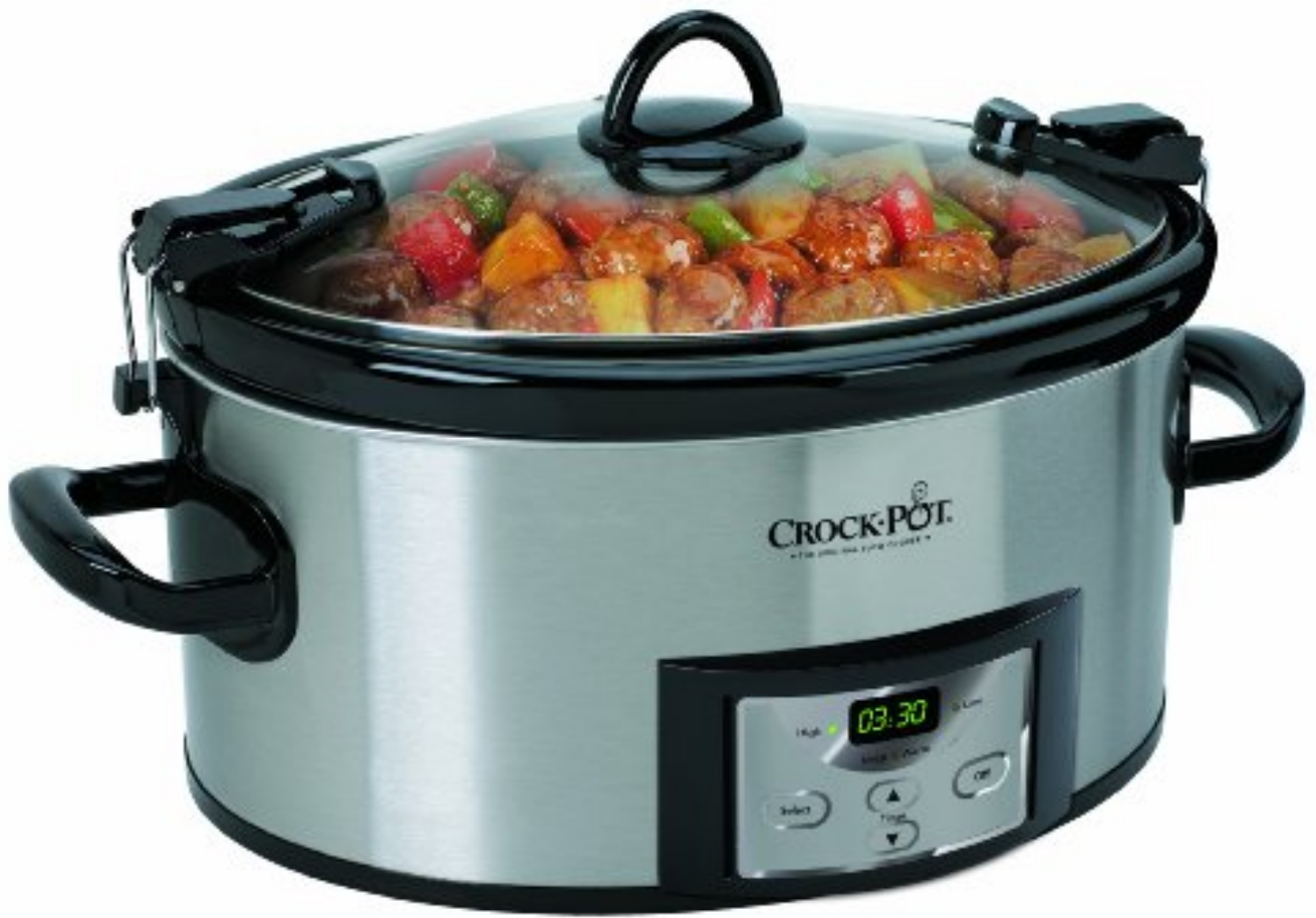
Crock-Pot Programmable Cook and Carry Oval Slow Cooker